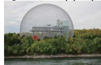
Fuller dome at the 1967 Expo in Montreal